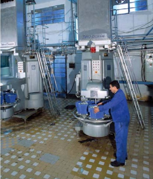
top left: KMK's tube heading machine produces 120 tubes per minute.