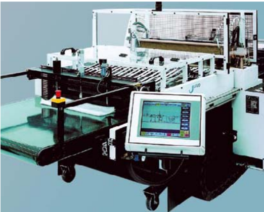
bottom left: Tetra Pak will use ETHERNET Powerlink during the further development of the existing packaging machine generation.