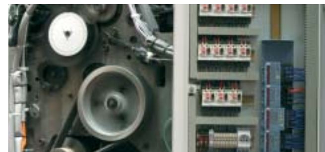
Open printing unit of the Polly Performer 66 with the complete controller system. Electronics and mechanics are integrated into a single housing.

The entire application project was developed by the engineers at Grafitec themselves. There were only a few especially complex procedures which had to be worked out together with engineers from the B&R subsidiary in Brno. The software engineers were especially fond of the advantages of programming and maintaining projects using high-level languages in the B&R Automation Studio development environment. It was obvious that the quality and manner of fair and constructive cooperation between