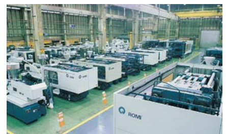
Facilities at Romi are equipped with the most advanced industrial equipment.

To start with, Automation Studio provides an extensive supply of libraries specially suited for plastics technology. In addition, the application can be divided into several levels: The lowest level contains functions for handling sensors and controlling the actuators. The actual axis control is taken care of one level above that. The highest level is the process manager. It coordinates the entire machine process in all of its various modes: automatic, semiautomatic, manual, and setup. A separate unit where parameters are configured is controlled via the command interface which results in the visualization. This was written in