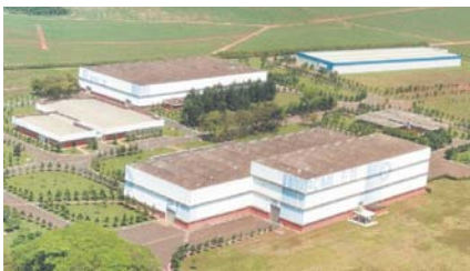
Romi's plant in Santa Bárbara D'Oeste, in the region of São Paulo.

The Brazilian market for plastic injection molding machines finds itself in recession, and a recovery is not expected before the fourth quarter of 2003. Despite this, companies in this industry are chalking up positive results. This is made possible, even in this sub-par economic environment, by occupying an existing niche or having more technologically developed products than competitors.