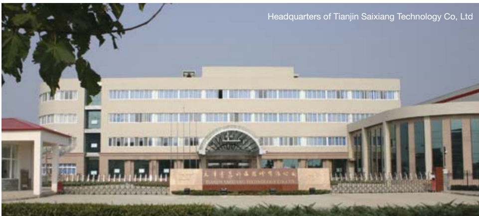
Headquarters of Tianjin Saixiang Technology Co, Ltd